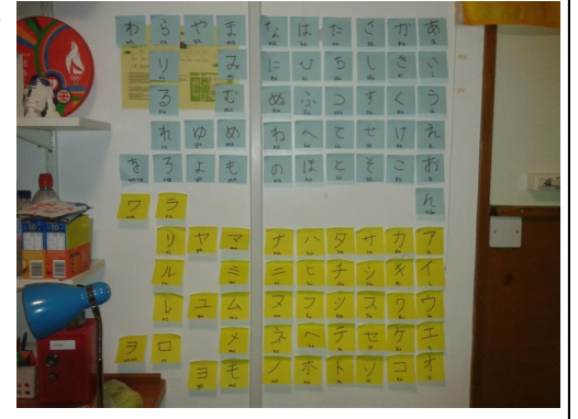
In my room at my accommodation. Trying to learn the Kana!

the weekly 'Oshaberikai' ran by the Anglo-Japanese society. This has meant that I have been able to improve my speaking through practice with natives; something that I'd never been able to do before at sixth form. So it's safe to say that I've really enjoyed Japanese at Newcastle University. It's an awesome language, a great course, and it's taught by great teachers and I'm very glad I've had the chance to study Japanese here. 日本語はとても楽しい